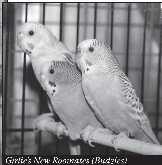
Girlie's New Roommates (Budgies)

For those of you who know me it is no news that if it has Exotic Feathers, big or small, I will drive two States over if it needs help.