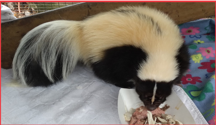
Pepe the Skunk

As always, you can go to our website and safely donate through paypal!